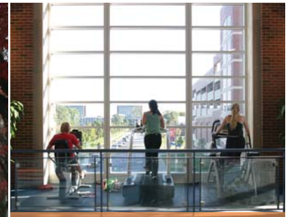
Left: CRCE entrance Above: CRCE upper level

Opened in 1988, the Campus Recreation Center East (CRCE) facility received an addition and facelift in 2005 becoming the perfect complement to the Activities and Recreation Center (ARC).